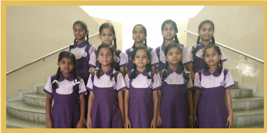
MATRU MANDIR BATCH - I