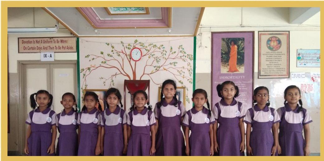
MATRU MANDIR BATCH - II